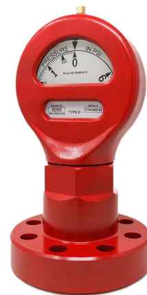
Flanged Type D Gauge