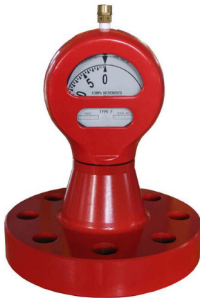
Flanged Type F gauge